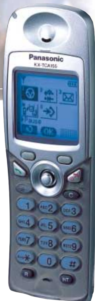
KX-TCA155 Basic Model